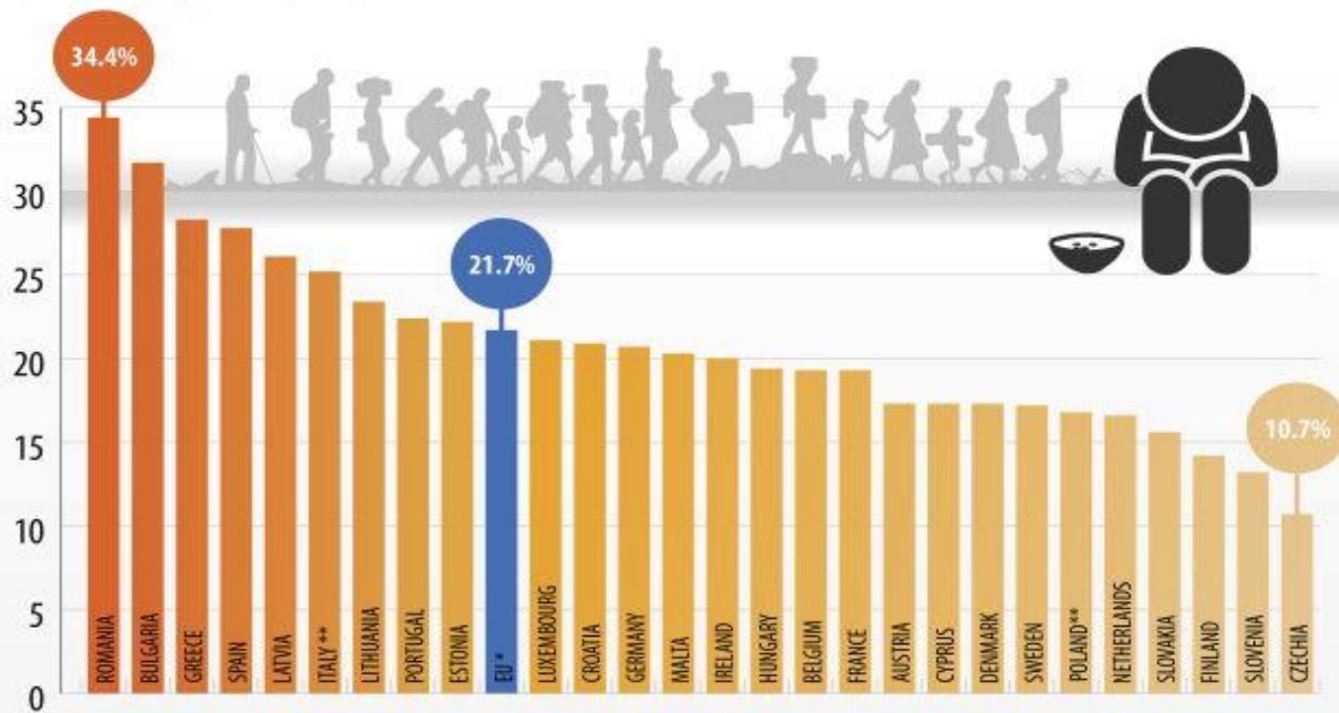
People at risk of poverty or social exclusion in the EU Member States (% of total population, 2021)